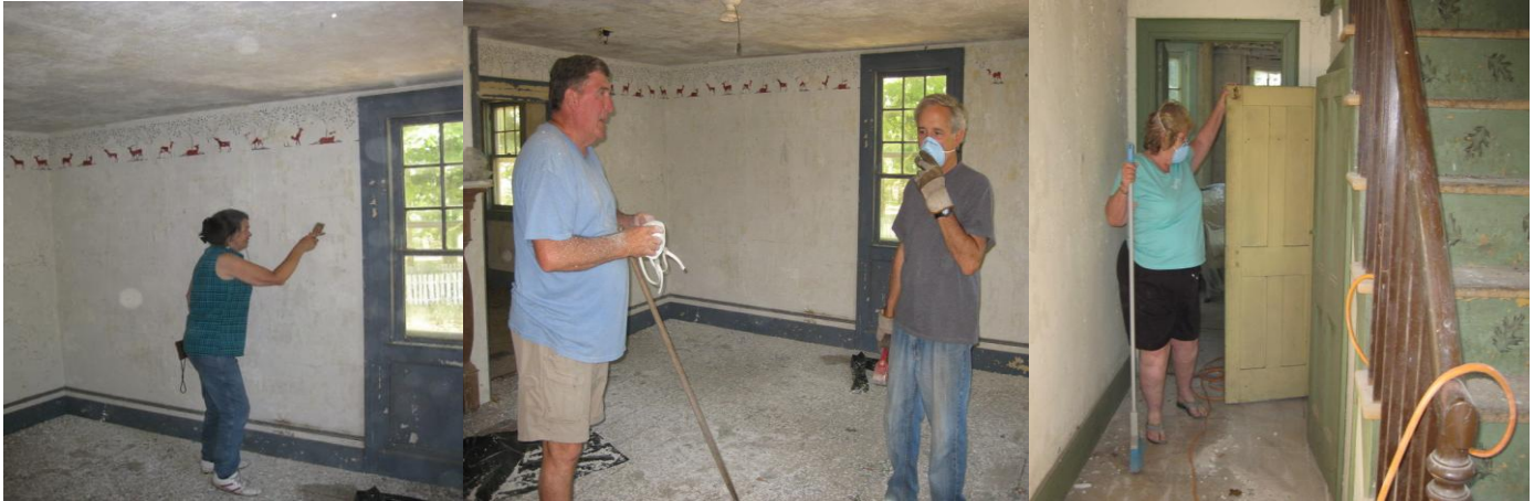
Clean up crew at work

In early July several Society members did an initial scraping of the walls and ceilings, cleaned out the fire closet in preparation for the fire alarm and security systems, swept out the house, and did a careful inventory of major repairs. We also collected and catalogued paint chips from each room. Our current plans are to try and paint each room in a color that closely matches the original paint color. Most rooms had plaster walls with several coats of paint.