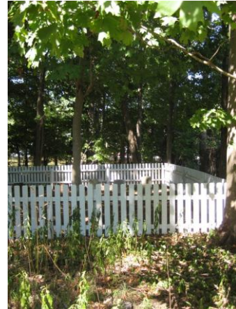
New Cemetery Fence