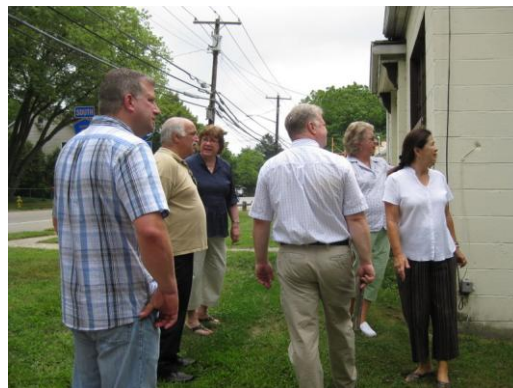
Group on tour