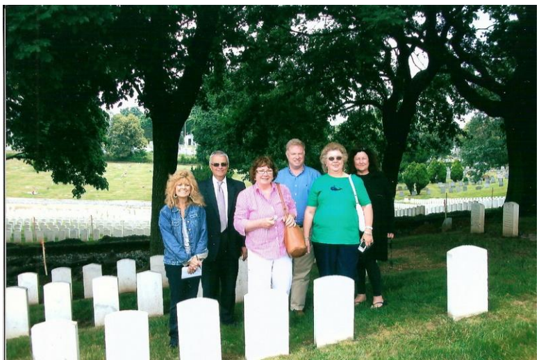
Booth Committee on Duty