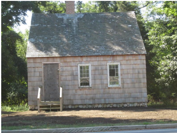
Front lawn initial grading; more topsoil on order

Lawn and exterior landscaping —initial topsoil has been delivered and spread; additional loads of topsoil have been ordered and grading will be done this fall. Options for an appropriate front entrance are being evaluated.